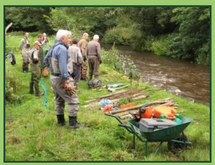
DNMAC volunteers prepare equipment for work on the bank of the River Govt in Derbyshire

'There might be plenty of people that use an urban river corridor, but it would be just as attractive to them if it was a canal and there was a nice towpath and it wasn't sort of biologically diverse...whereas there is a particular value – a particular ecosystem value – that game anglers, and coarse anglers as well, would [place on the river]. They would notice if it [the river] deteriorated, and they'd also feel strongly about trying to protect it.'