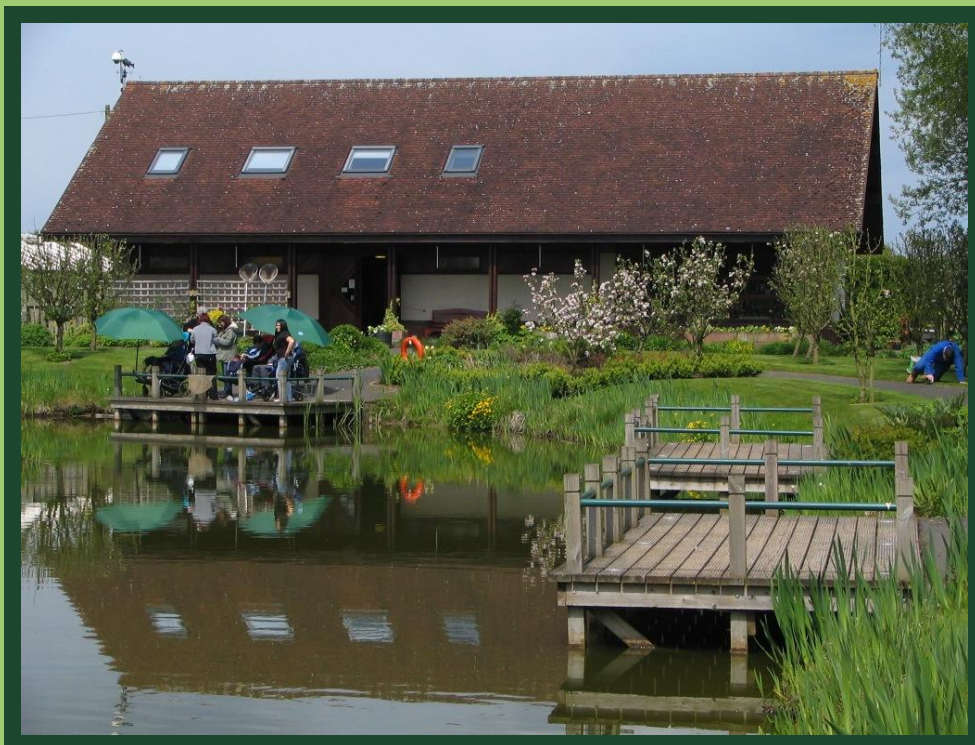
Albrighton Trust Moat & Gardens has seven wheelchair-accessible fishing platforms

'We do tend to bring people [i.e. clients of Mencap] out here quite a bit. It's the fishing side of it that they do love ... we have children who have got autism. You cannot sit autistic children down for two minutes, [but] you put them on those [fishing platform], give them a rod – with [supervision from] a carer – and the parents are just absolutely amazed when the children don't move. Now that is something for a child with autism.'