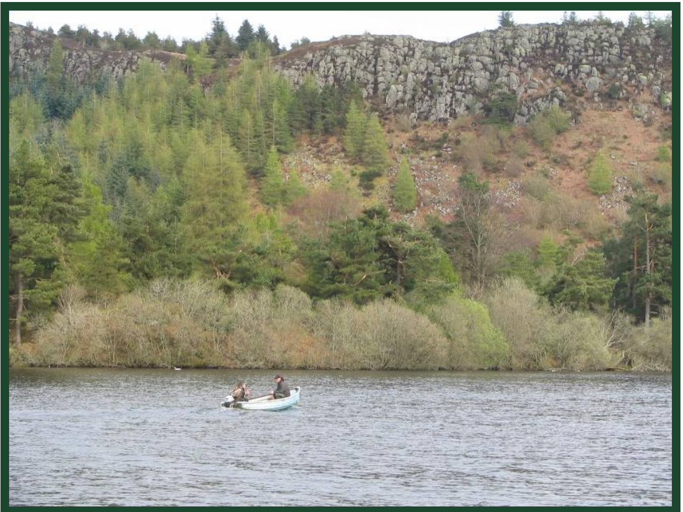
Two anglers fish from a boat at North Third Trout Fishery, Scotland

part of the Social and Community Benefits of Angling project, and are evidence of the capacity of angling to provide participants with the kind of positive outcomes that contribute to an improved sense of personal well-being.