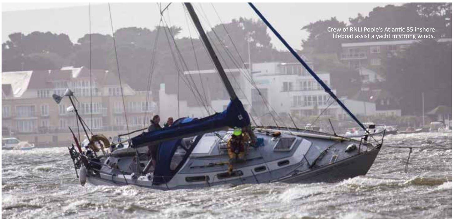
Crew of RNLI Poole's Atlantic 85 inshore lifeboat assist a yacht in strong winds.

To meet these objectives, semi-structured interviews with 25 yacht sailors were undertaken. These were complemented in four focus groups with yacht sailors. These took place in Largs, North Ayrshire; London; Lytham St Annes, Lancashire and Parkstone, Dorset.