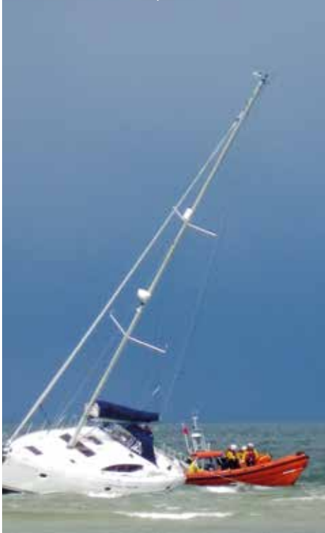
Crew of RNLI Poole's Atlantic 85 inshore lifeboat aid a stranded yacht.

This project was undertaken by a research partnership, Substance, between August 2014 and February 2015. It adopted both qualitative and quantitative methods involving: