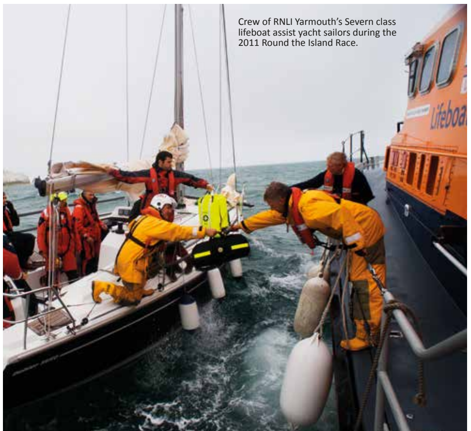
Crew of RNLI Yarmouth's Severn class lifeboat assist yacht sailors during the 2011 Round the Island Race.